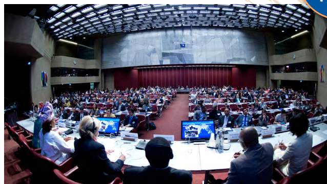
A general view during the Diaspora Ministerial Conference.